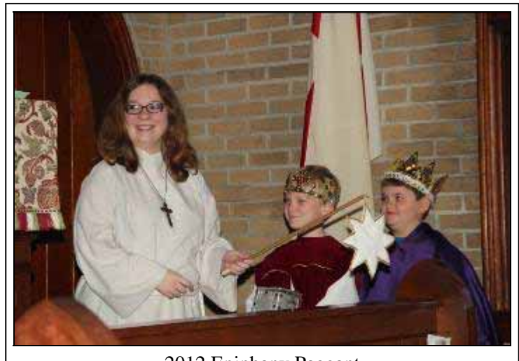
2012 Epiphany Pageant

Feast of the Baptism of Christ Annual Parish Meeting & Potluck Luncheon